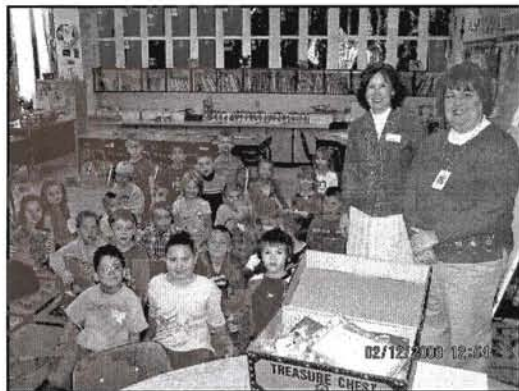
BHACF sponsored a Treasure Chest for the Black Hawk Elementary School through the Partnership Rapid City program